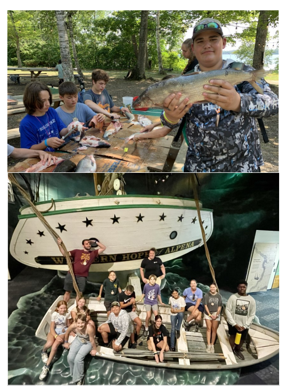
4-H Great Lakes and Natural Resources campers explore fisheries science and maritime history.

Dedicated to the protection and sustainable use of the Great Lakes and coastal resources, Michigan Sea Grant is a cooperative program of the University of Michigan, Michigan State University, and the National Oceanic and Atmospheric Administration (NOAA). Through MSU Extension, Michigan Sea Grant works with Michigan's people. industries, and coastal communities to encourage their use, benefits, and enjoyment of Great Lakes resources that positively influences our state's economy, environment and quality of life.