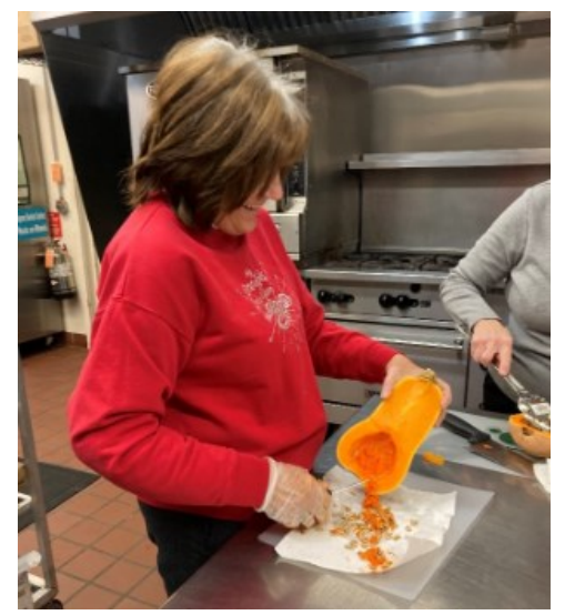
Cooking Matters, Alpena Senior Center

MSU Extension is here to support all the ways we can live healthier lives, be strong and successful and build healthier communities, by bringing the vast knowledge and resources of MSU directly to your community. MSU Extension offers programming and resources for social-emotional and mental health, chronic disease and diabetes management, food safety and food reservation, developing heathy relationships, caregiving and parenting, nutrition and physical activity and more. Supported by the Expanded Food and Nutrition Education Program and the Supplemental Nutrition Assistance Program-Education (SNAP-Ed), MSU Extension helps create long-lasting, positive changes - from community gardens to childcare homes and beyond.