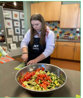
Participant at Art in the Loft partnership program.