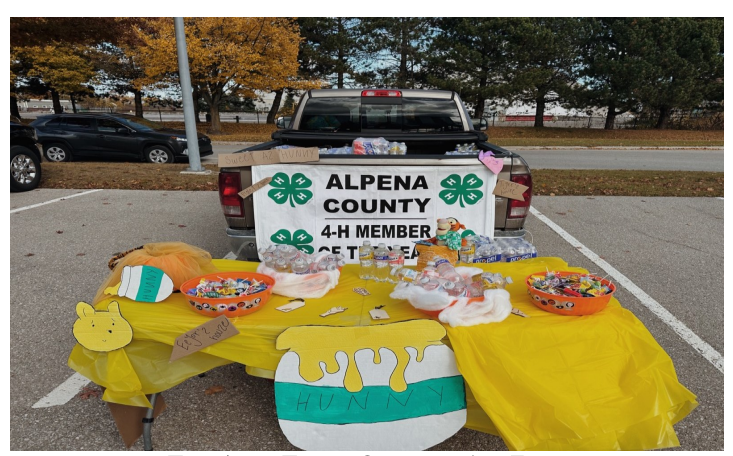
Trunk or Treat Community Event