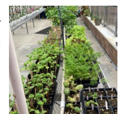
All plants pictured were started from seeds planted by students.

worked with the lead teacher and greenhouse expert to propose a grant submission to help Pied Piper grow their own vegetables and herbs. They used the $1,000 grant fund to purchase supplies to help them enhance their greenhouse success and items to make serving those fruits and vegetable easier.