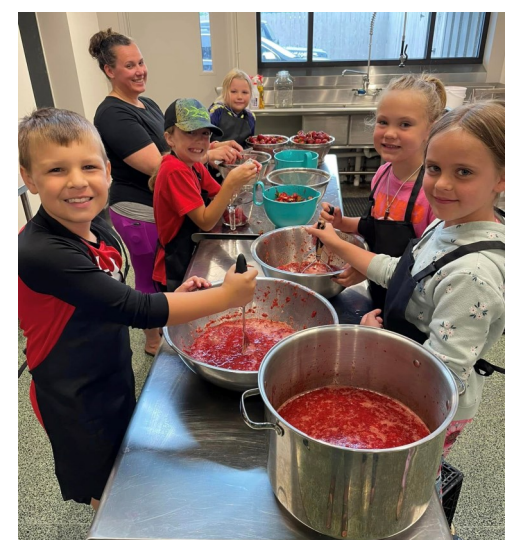
Youth from 24 Carrot 4-H Club work together to make jam.