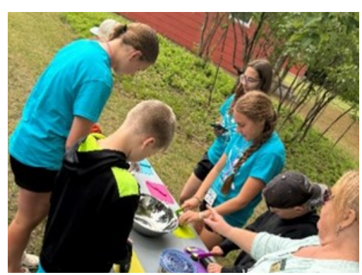
Safe food and knife handling with a veggie dip tasting at Oqueoc 4-H