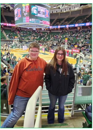
Youth smile at 4-H Day at the Breslin Center.