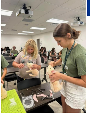
Youth participating at Exploration Days, on MSU's campus.