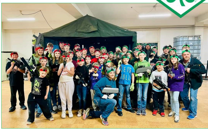
Point member challenge laser tag night