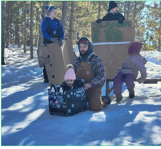
The cardboard sledding event had a focus on STEM learning.

The largest youth development organization in Michigan, 4-H provides thousands of young people with experiential learning opportunities to explore new interests and discover their passion.