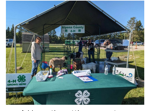
4-H youth petting zoo at an elementary school celebration