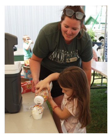
Youth making homemade ice cream.