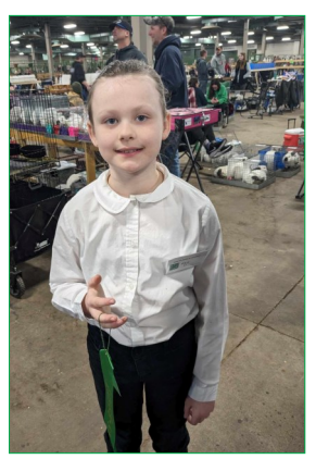
One of two youth at the State Rabbit Expo.