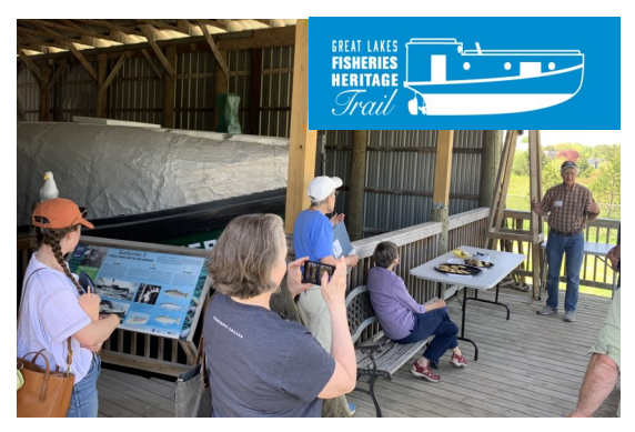
Guests touring Great Lakes Fisheries Heritage exhibits at the Besser Museum.