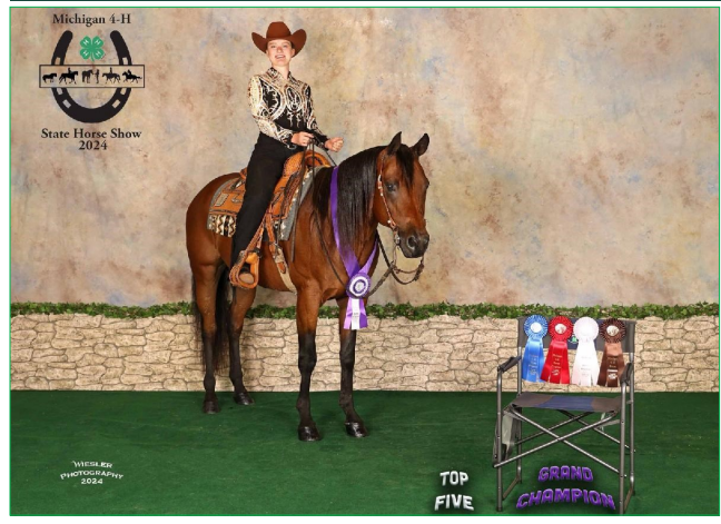
Alpena youth representing Alpena well at the State Horse Show.