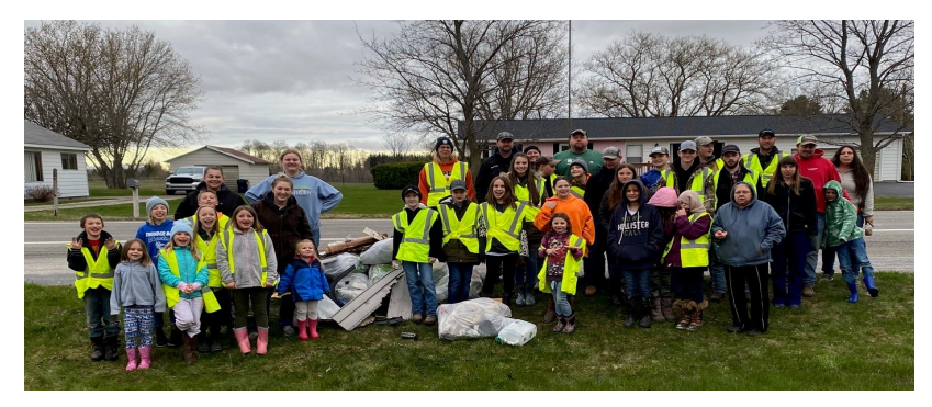
Adopt-A-Highway and Pied Piper programming