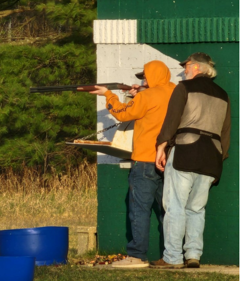
Four youth and three volunteers received certification in shooting sports modalities.

4-H Ocqueoc Outdoor Center overnight campers smile for picture.